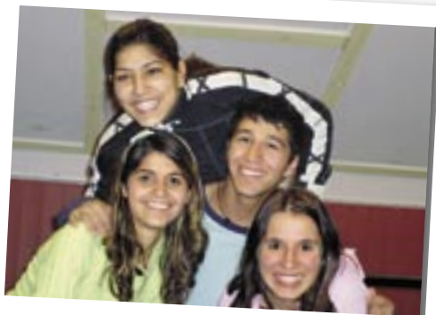
Young people enjoy spending time in FCE's youth centre, "The Club".

FCE supports a social-evangelical work in a Roma village. People who overcome alcoholism, start to work and look after their children. This proves that the work is successful.